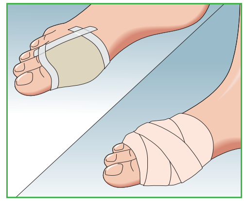
3. Border with Mepitac® soft silicone tape to fixate in place or cover with a non-adhesive fixation product such as Tubifast®.