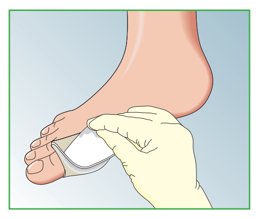
2. Remove one side of the release film and apply Mepilex® Lite to the side of wound. Do not stretch. Remove remaining film and gently smooth in place.