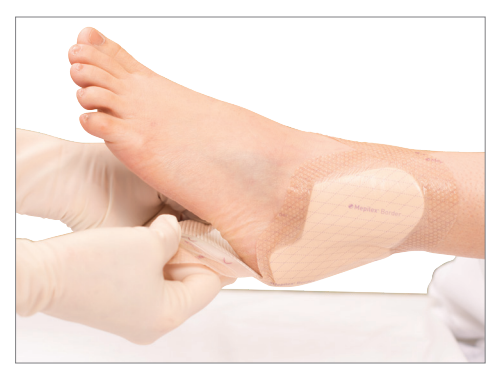
4. Gently apply the adherent part of the dressing marked 'B' (see illustration above) under the plantar surface of the foot. Do not stretch.