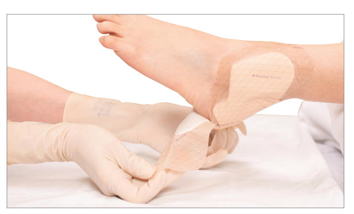
2. Continue to release the dressing from the skin using the handling tabs until the skin is exposed for skin check.