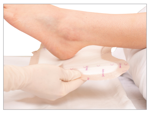
2. Apply the adherent part of the dressing marked 'A' (see illustration above) to the posterior heel/ Achilles tendon areas, positioning the narrowest part of the dressing at the base of the heel. Do not stretch.