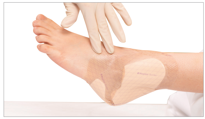
\bf 6. Press and smooth the dressing to ensure the entire dressing is in contact with the skin.