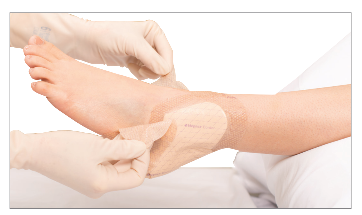
1. Gently pull handling tabs to release dressing from skin.