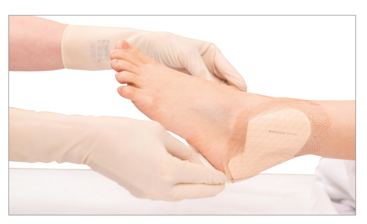
4. Re-apply the foam and border of the dressing. Make sure the flaps with the tabs are placed over the ankle flaps.