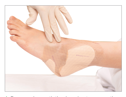
6. Press and smooth the dressing to ensure the entire dressing is in contact with the skin.