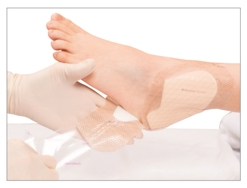
5. Remove the backing from one of the area ' B ' flaps (flaps with tabs). Apply and smooth border. Repeat with the other side. Do not stretch.