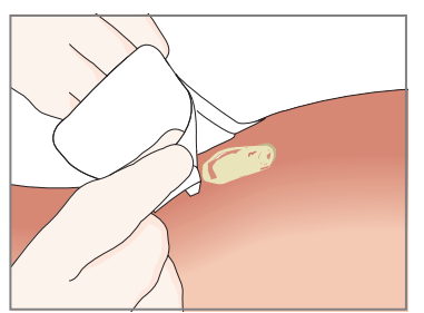
2. Lay absorbent foam pad over wound area. Gently smooth adherent border in place. Do not stretch. Mepilex® Border Flex can remain in place for up to 7 days depending on drainage and wound condition.