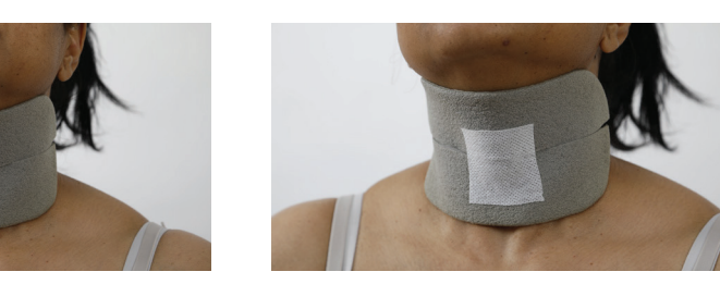
5. Secure the two dressing parts with one piece of Mefix (about 5cm long).