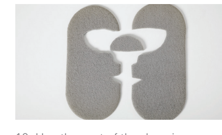
9. Now the dressing is cut to cover one 10. Use the part of the dressing you removed to cover the nose.