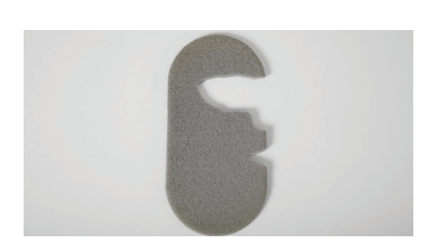
8. Cut out enough space in the dressing to accommodate the nose, where you identified the location of the wing of the nose in the previous step.