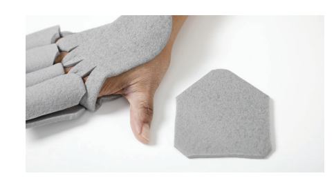
11. Roll the dressing around the thumb to cover it.