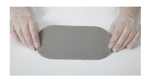
1. Use Mepilex Ag 10x20cm.