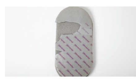
side of the face; use this pattern to cut another dressing.