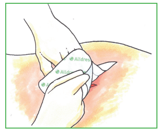
Remove the remaining backing paper and lay dressing over the wound. DO NOT STRETCH. Gently smooth the edges in place to ensure secure adhesion