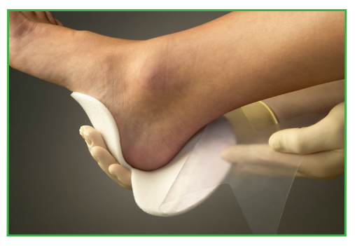
5. Fixate the dressing under the foot. Remove the shorter release film and mould the dressing around the heel bringing edges together.