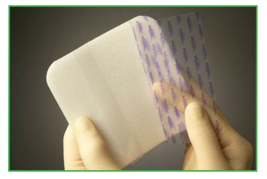
1. Gently cleanse the wound; dry surrounding skin. Choose a size that will allow the dressing to overlap the wound area by at least 2cm. Remove the release film.