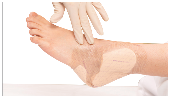
6. Press and smooth the dressing to ensure the entire dressing is in contact with the skin.