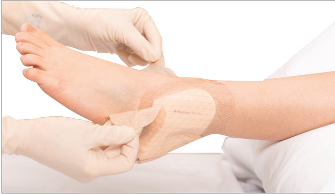
1. Gently pull handling tabs to release dressing from skin.