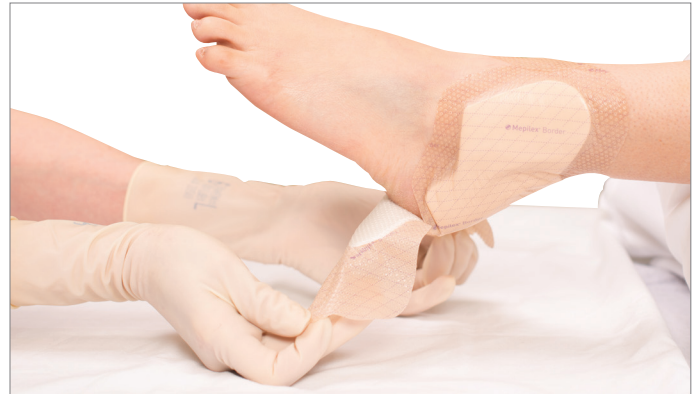
2. Continue to release the dressing from the skin using the handling tabs until the skin is exposed for skin check.