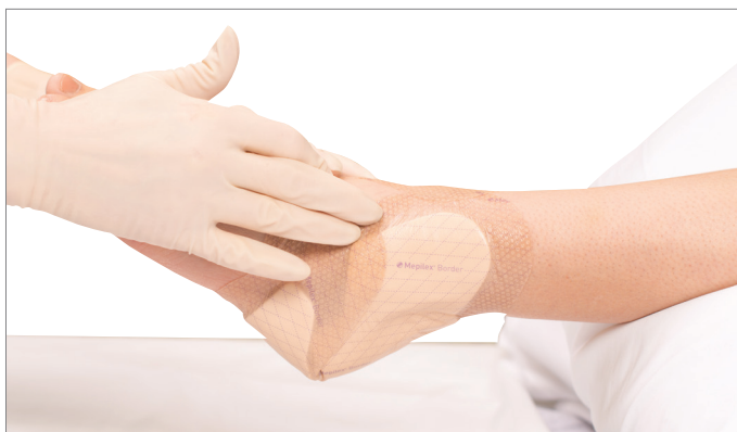
5. Confirm dressing is replaced to its original position, making sure the border is intact and flat.