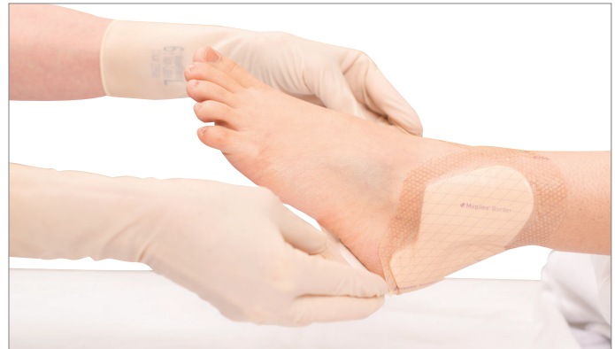
4. Re-apply the foam and border of the dressing. Make sure the flaps with the tabs are placed over the ankle flaps.