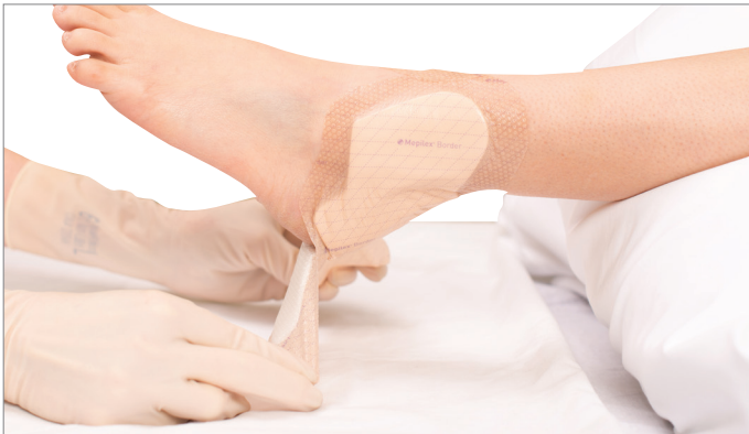
3. While maintaining the dressing position at the proximal edge of 'A' (see picture), perform assessment of the skin.